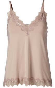
341 VINTAGE POWDER