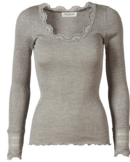
008 LIGHT GREY MELANGE