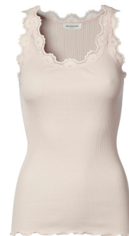
337 SOFT ROSE