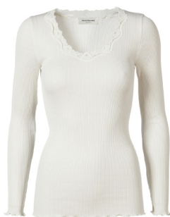
1049 NEW WHITE