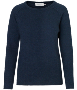
214 DARK BLUE MELANGE