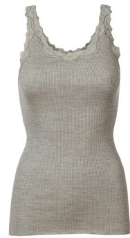
008 LIGHT GREY MELANGE