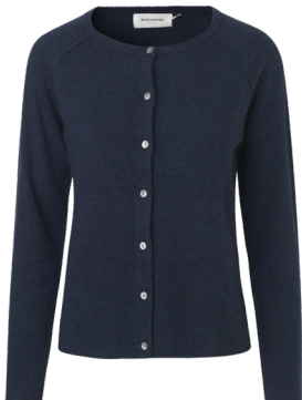
214 DARK NAVY MELANGE