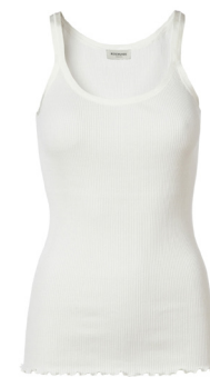
1049 NEW WHITE