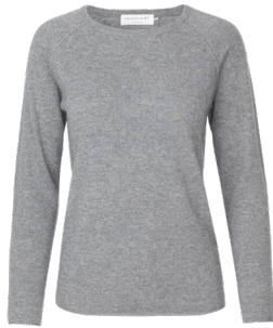
008 LIGHT GREY MELANGE