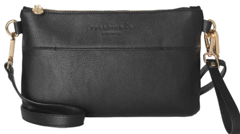
BO144-6050 BLACK GOLD 16 CM X 28 CM

Complete the look with our selection of classic bags. Our bags in vegan leather are designed with versatility in mind, featuring detachable and adjustable straps for a wide range of usability.