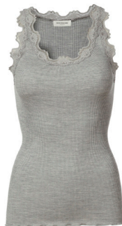
008 LIGHT GREY MELANGE