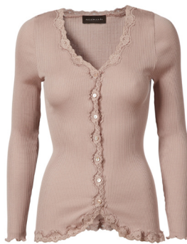
341 VINTAGE POWDER