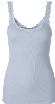
205 HEATER SKY