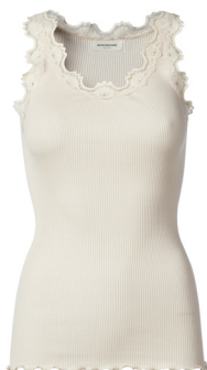
050 SOFT POWDER