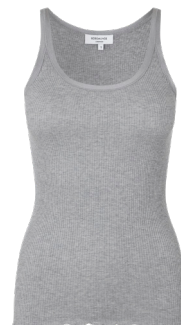
008 LIGHT GREY MELANGE