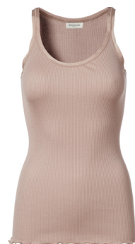
341 VINTAGE POWDER