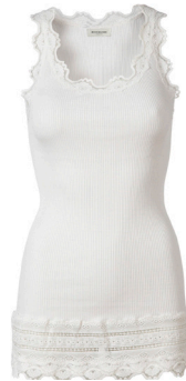
1049 NEW WHITE