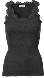
009 DARK GREY MELANGE