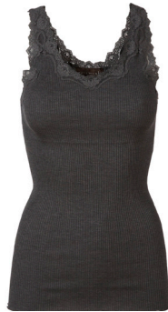
009 DARK GREY MELANGE