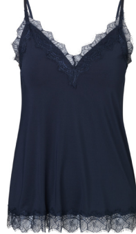
192 DARK BLUE