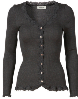
009 DARK GREY MELANGE