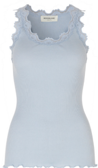
205 HEATHER SKY