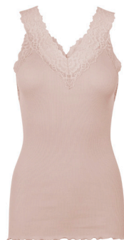
341 VINTAGE POWDER