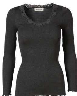
009 DARK GREY MELANGE