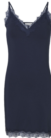
192 DARK BLUE