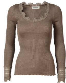
821 BROWN MELANGE