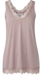
341 VINTAGE POWDER