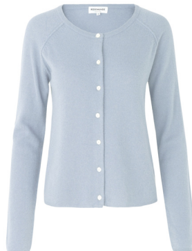
205 HEATHER SKY