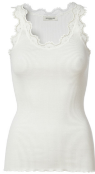
1049 NEW WHITE