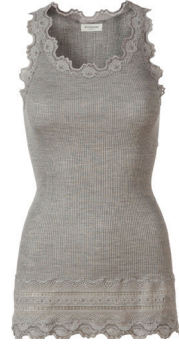
008 LIGHT GREY MELANGE