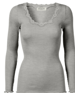
008 LIGHT GREY MELANGE