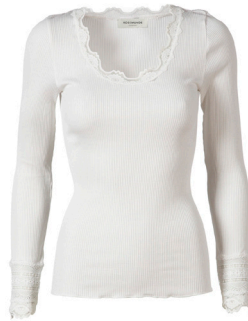
1049 NEW WHITE