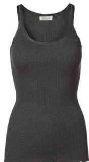
009 DARK GREY MELANGE