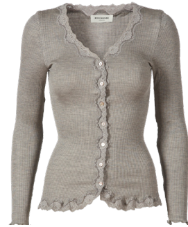
008 LIGHT GREY MELANGE