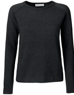
009 DARK GREY MELANGE