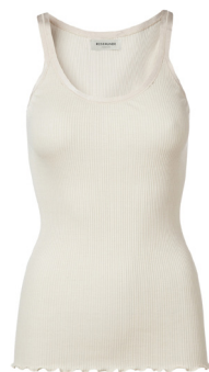
050 SOFT POWDER