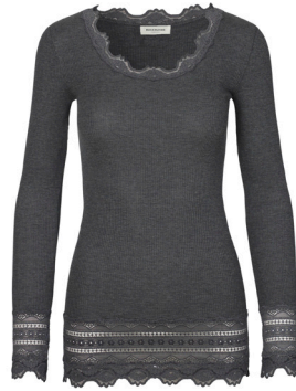
009 DARK GREY MELANGE