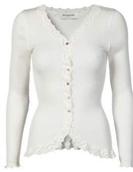
1049 NEW WHITE