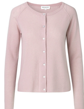
341 VINTAGE POWDER