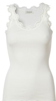
1049 NEW WHITE