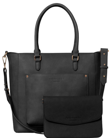
BO256-6050 BLACK GOLD 36 CM X 36 CM, D: 15 CM