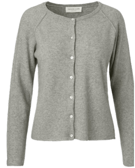
008 LIGHT GREY MELANGE