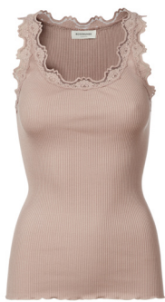
341 VINTAGE POWDER