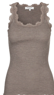
821 BROWN MELANGE