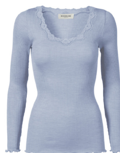
205 HEATHER SKY