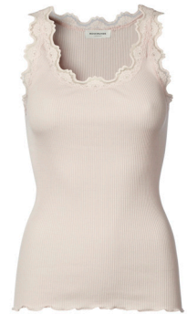
337 SOFT ROSE