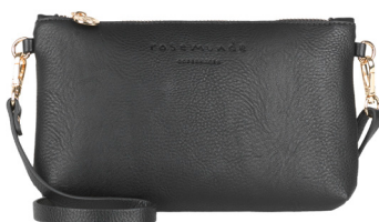
BO222-6050 BLACK GOLD 13,5 CM X 21 CM