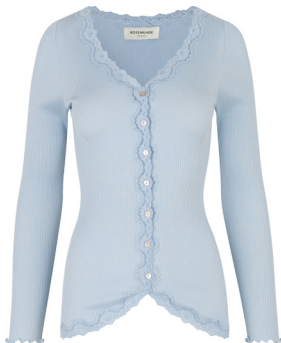
205 HEATHER SKY