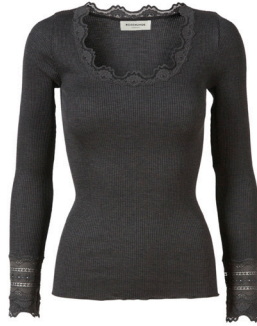
009 DARK GREY MELANGE