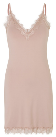
341 VINTAGE POWDER