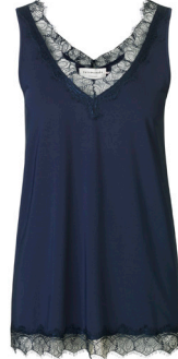
192 DARK BLUE