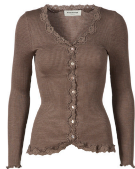
821 BROWN MELANGE