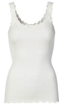
1049 NEW WHITE