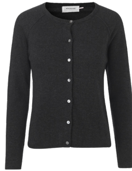
009 DARK GREY MELANGE