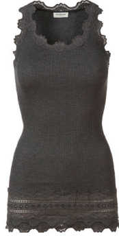
009 DARK GREY MELANGE